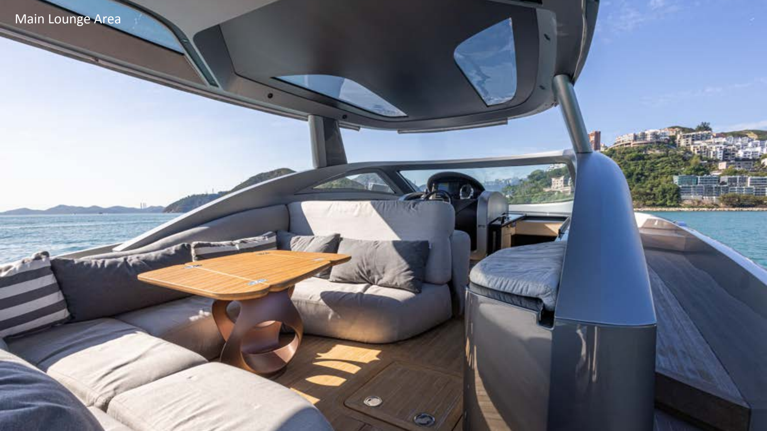
Main Lounge Area